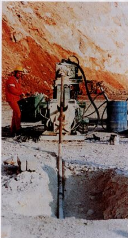
Powermole's new dry rock directional drilling system in action.